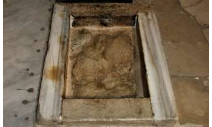
Rock with Jesus' foot imprint at time of Ascension

First , on Ascension we explore Jesus' departure from the Mount of Olives into the realm with God as he completed his ministry with us and the post-resurrection forty days of encouraging the disciples in their ongoing witness and teaching. Jesus sets us all free with his revelation of God's Power that brought he and others back to life, provided healing, this same Power available to help us deal with chaos to become whole!